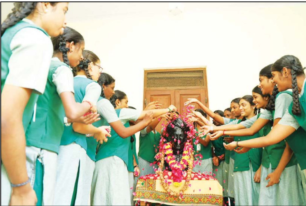
Students of Children's Garden School, Mylapore offered flowers at the bust of Dr. Sarvepalli Radhakrishnan, late president of India, scholar, philosopher and educator, on the occasion of Teachers Day. His birth anniversary is celebrated as Teachers Day and his residence is near the school and located on the road named after him.