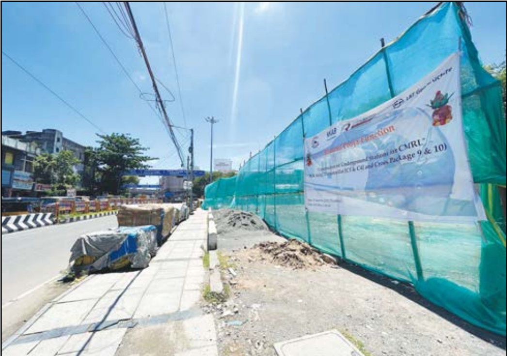
Barricaded land opposite Vivek store on Royapettah High Road ( above); a section of Luz Church Road near Luz Circle barricaded ( below)