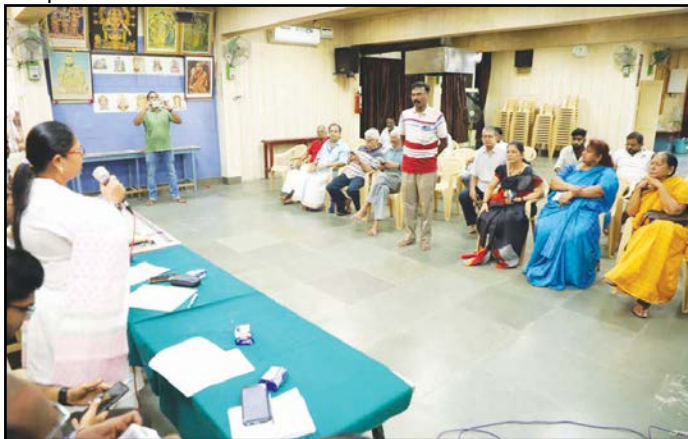
File photo of another area sabha meet