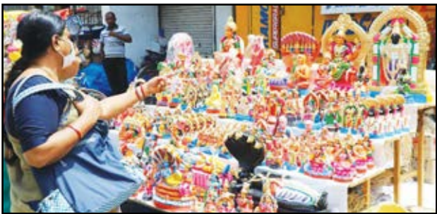
Scene on North Mada Street, Mylapore