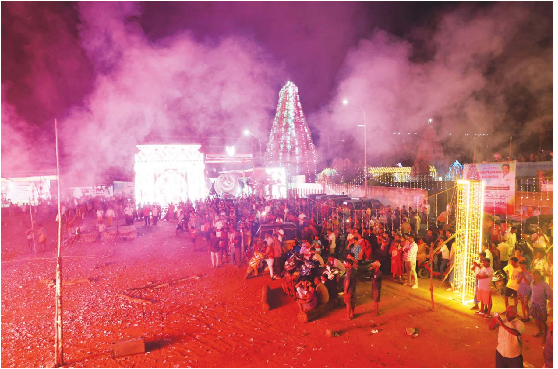
The annual Aadi festival celebration at Sri Thulukanathamman Temple in Srinivasapuram, Pattinapakkam was a grand one. At the finale, a variety of fire-crackers were burst.