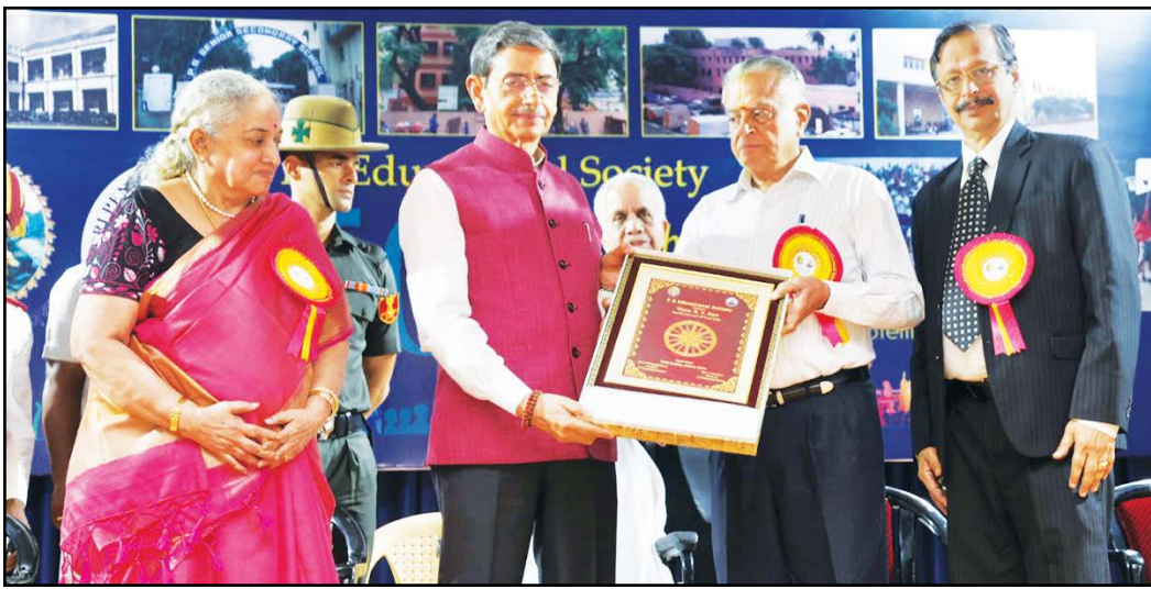
Tamil Nadu governor R. N. Ravi was the chief guest at the finale event held to commemorate the golden jubilee of P. S. Educational Society on Sept.7 at a hall in the P S School campus.