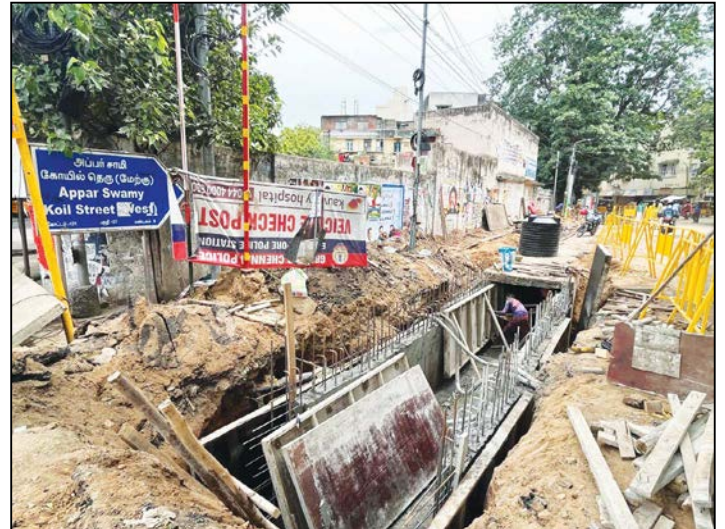
New storm water drain under construction in Apparswamy Koil Street; photo shot on Aug.29

form us of the measures taken for this year's monsoon preparedness.