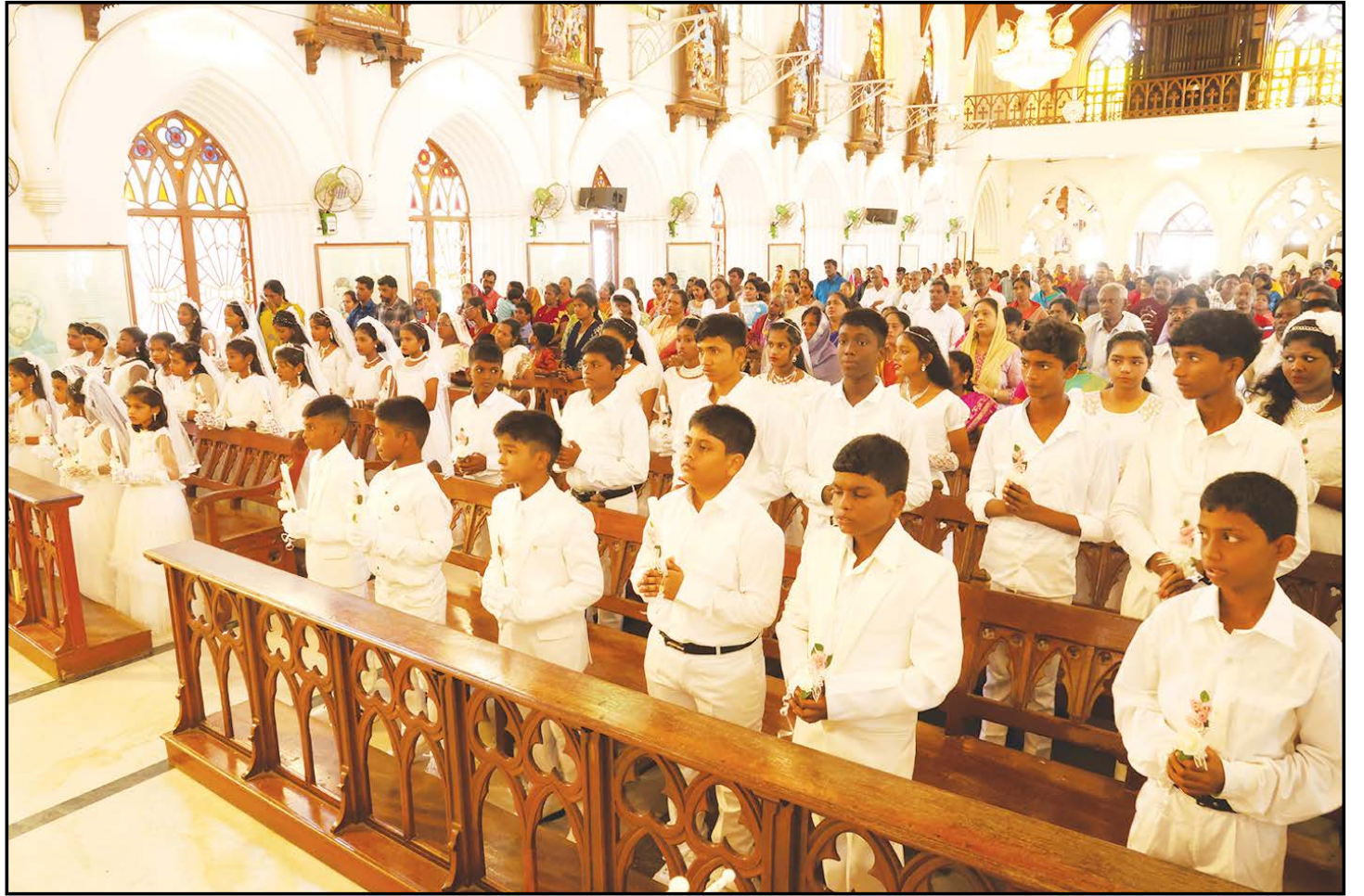
Holy Communion Mass was celebrated recently at the St Thomas Cathedral, San Thome. About one hundred children received their first Communion