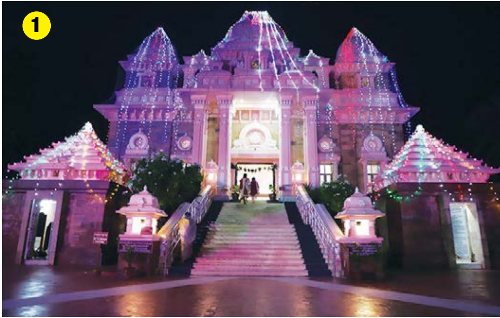
1 Universal Temple on Ramakrishna Math campus: decorated for Durga puja celebration