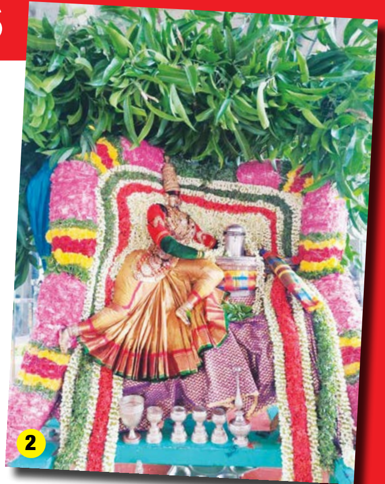
2 Karpagambal at Sri Kapaleswarar Temple this past week.