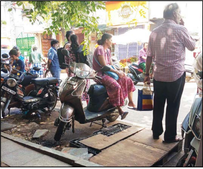
Mylapore Fund clients seen on South Mada Street as they await their turn to access lockers