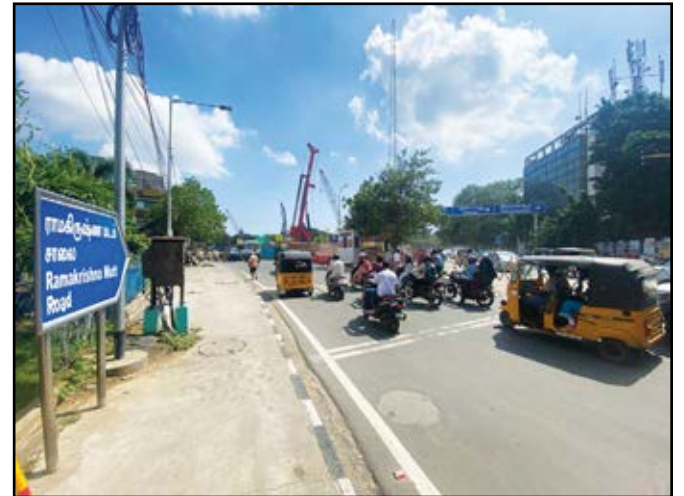
The traffic diversion on R. K.Mutt Road has been scrapped