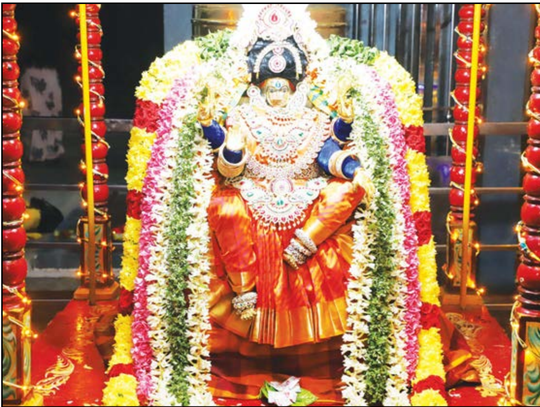
The Amman at Sri Kolavizhi Amman Temple in Mylapore is being colourfully decorated in the alankaram all days of Navaratri.