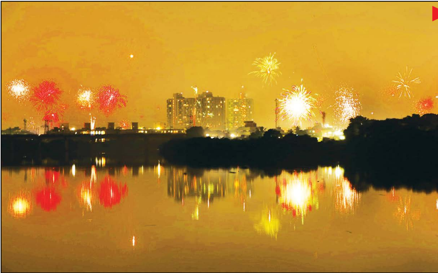
Fireworks light up the sky over the Adyar river in the R. A. Puram zone on Deepavali night

PHONE : 4766 2029 / 2498 2244 WEBSITE : www.mylaporetimes.com EMAIL : mylaporetimes@gmail.com