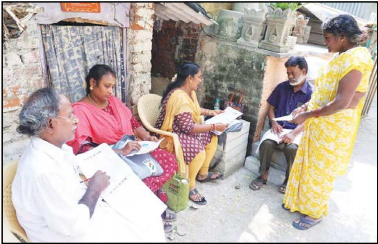
Booth level officers in Kapali Thotam

The Special Intensive Revision ( SIR) of electoral rolls which is now going on across Tamil Nadu, has also been covering the Mylapore zone. In recent days, booth-level officers ( called BLOs) have been covering all the residences in streets and roads that fall under the booth which is where you cast your ballot in an election; they have been distributing forms to all those whose names are found in the electoral rolls.