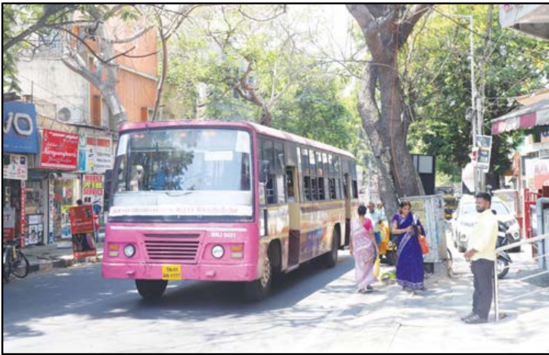
On R K Mutt Road, Mylapore.