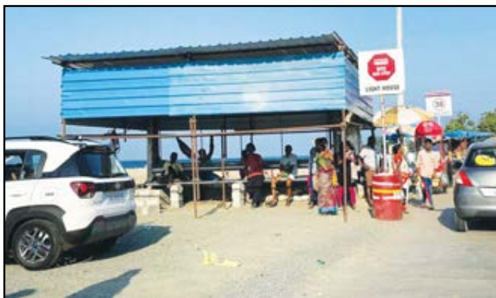
On Marina Loop Road