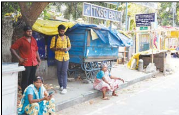
On Luz Church Road

In the 37 degrees heat, commuters are being roasted at these stops, saved only by the shade of avenue trees or sunshades of local shops.