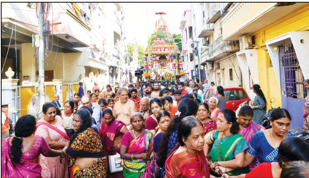
Chithirai Thiruvonam Vizha was celebrated at Sri Madhava Perumal Temple in Mylapore. It started on April 21 and ended on April 30. On Sunday, April 27, a few hundred people participated in the ther (chariot) procession, many stepping in to pull the ther for a few minutes in turn.