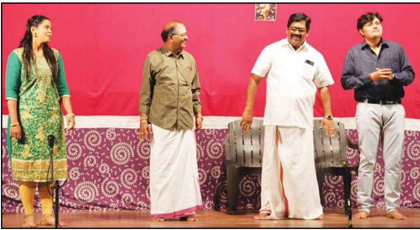
Scenes from 'Killadi Mappillai' (above) and 'Kalavu Neekiya Padalam' (below)

12 Tamil plays, all new ones, presented by well-known artistes in this field, are staged at this hall and all of them get a full house.