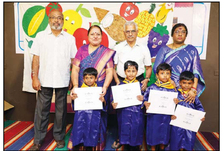
Chellammal Vidyalaya Nursery and Primary School, Mylapore had the Kindergarten convocation event on March 28 at Bharatiya Vidya Bhavan, Mylapore.