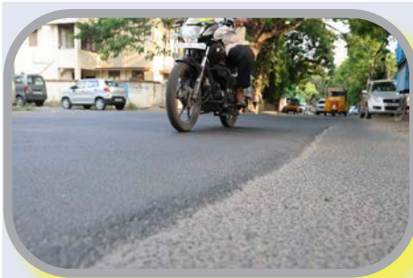
Thiruvengadam Street, a busy road for vehicles on 'diverted' route is a patchwork zone. Never been fully relaid.

Five: MTC created makeshift 'termini'; on Luz Church Road and in Mandaveli. But there are no bus bays, no rest spots, no washrooms for MTC staff and commuters. These are a few of the key issues that still need attention. It is for the new MLA, P. Venkataramanan to address them 'wholesome', not as patchworks.