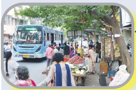
Hawkers flourish on the ever busy Venkatesa Agraharam Street. Have not been cleared up for good. This street is now like a main bus route road.

● Two bus stops on Singaravelar Salai (Marina Loop Road) do not have proper lighting