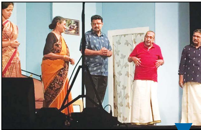
Scene from 'Jugalbandhi'

On May 28, 6.30p.m. at R R Sabha, Mylapore. Donor tickets open for booking - WhatsApp S B S Raman - 98400 45608. rates - Rs.120 onwards.