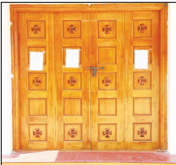
Locked main door of the Church

They also showed a communication from the archbishop, Rev. George Antonysamy that the church would be temporarily closed, that parishioners must attend religious services at other churches and that the pastoral council of the church