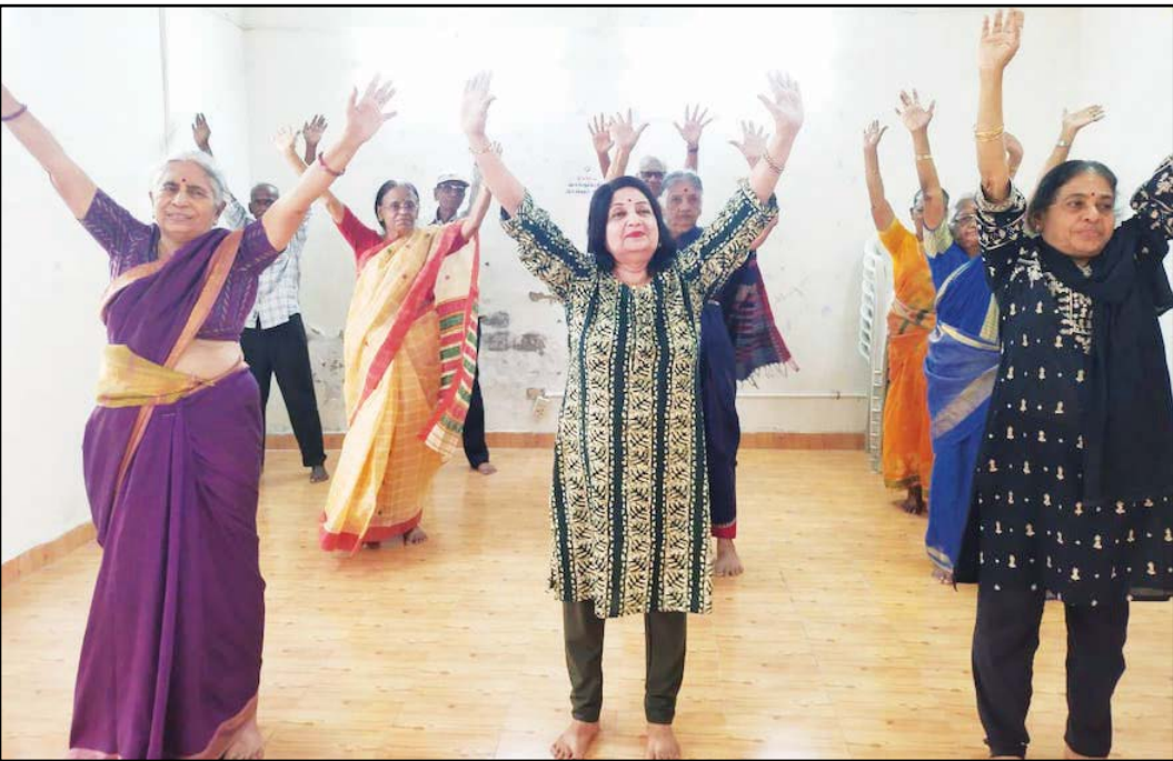
File photo of a Tehneer Arangam event