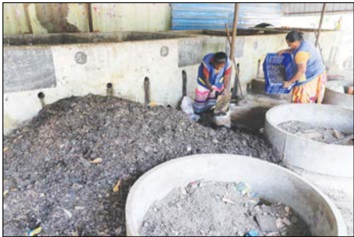
The recycling space on Sringeri Mutt Road, Mandaveli