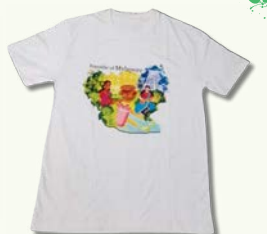
• T-SHIRTS Rs. 300