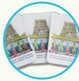
• FRIDGE MAGNETS Rs. 100

Call Mylapore Times - 2498 2244 to buy / order