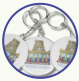
• KEY CHAINS Rs. 30