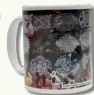
• COFFEE MUGS Rs. 250

Call Mylapore Times - 2498 2244 to buy / order