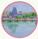
• INK ILLUSTRATIONS Rs. 100/200