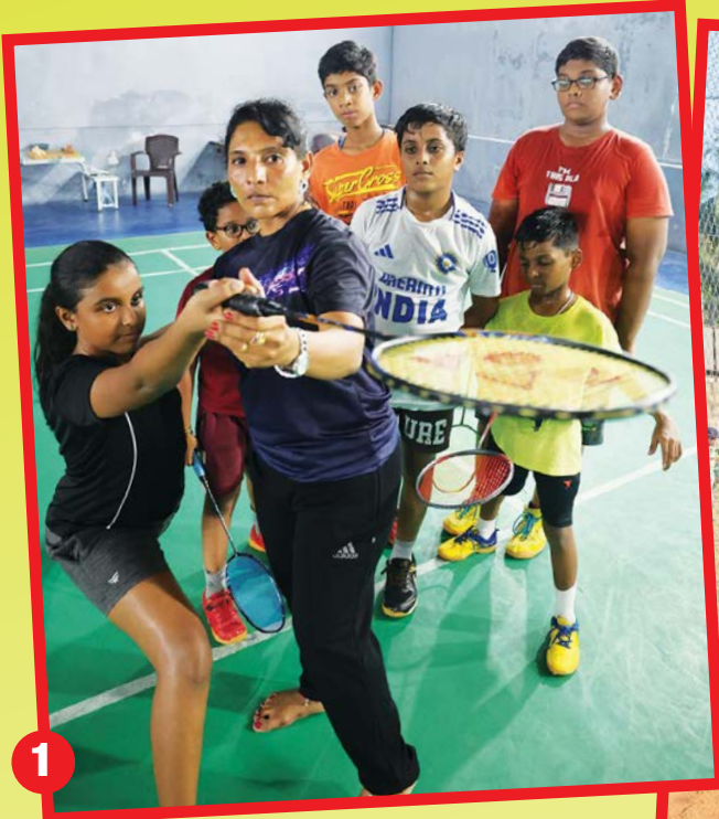
By Preetha K.

Outdoors and indoors, children are busy engaged at a variety of summer camps hosted across Mylapore. We stopped by at a few places to sense the buzz.