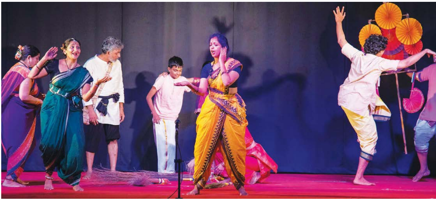
Scene from Shraddha Theatre's recent play 'Sangeetha Payithiyam'; an excerpt will be presented at the March 27 show