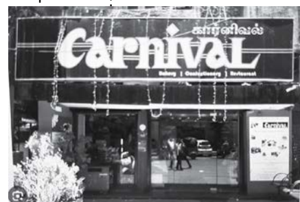
File photo of Carnival restaurant

● This column is curated by Kanaka Cadambi.