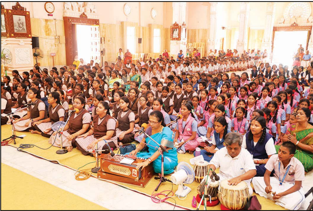
Groups of city school students took turns to sing bhajans at the temple as part of the silver jubilee celebration; on March 19