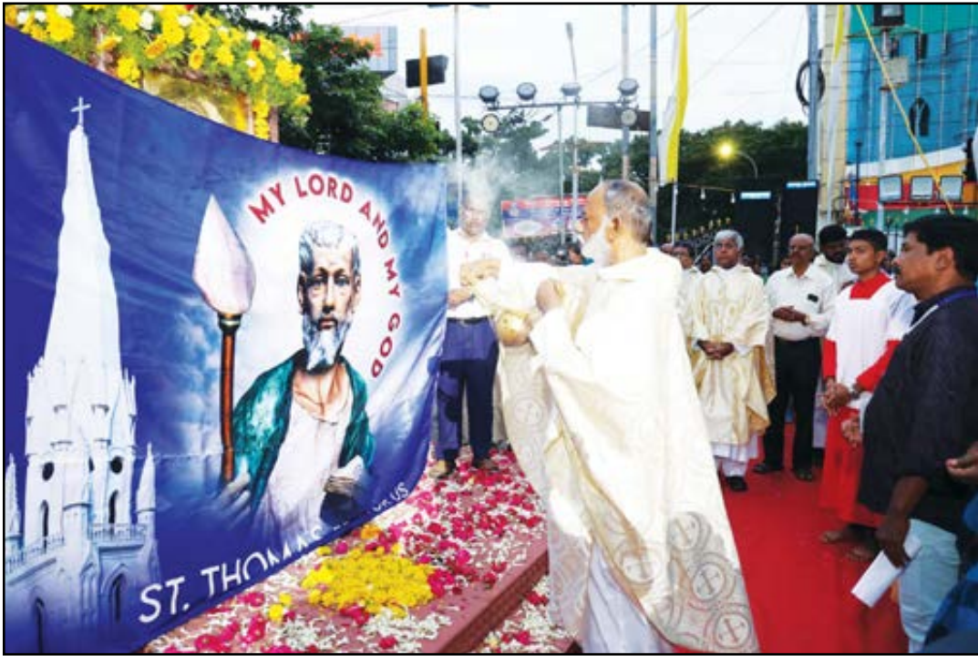
The annual feast of saint Thomas is being celebrated at St Thomas Cathedral in San Thome this week. It began with the symbolic flag hoisting ceremony and ends with a grand car procession on Sunday evening. Priests from various city churches are guest-celebrants at Holy Masses of this feast.

On June 20, the day of the star birth day of Kanchi Maha Periyaval, devotees took out a procession that evening from and to a temple dedicated to him in Mylapore's Pitchupillai Street.