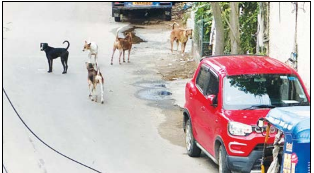
Stray dogs in Chitrakulam zone

This column also contains comments posted on our social media pages.