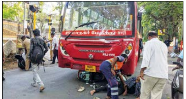
File photo of a recent minor accident near Bhaktavatsalam Road

Since buses have been diverted into smaller roads due to Chennai Metro work, we notice that some MTC bus drivers who take the roads around Nageswara Rao Park and Mandaveli MRTS station drive at great speed. They don't even bother to slow down at key junctions. These are potential spots for accidents. Schoolchildren who ride on cycles on these roads are exposed to some danger. GCC authorities should lay speed breakers at these junctions to avoid mishaps. MTC must ask drivers to temper the driving.