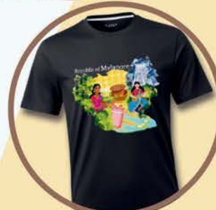
• T-SHIRTS Rs. 300

Call Mylapore Times - 2498 2244 to buy / order