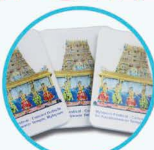
• FRIDGE MAGNETS Rs. 100