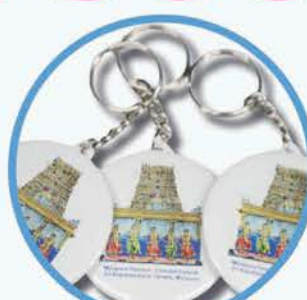
• KEY CHAINS Rs. 30