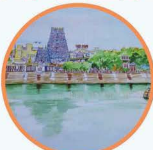
• INK ILLUSTRATIONS Rs. 100/200