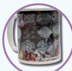
• COFFEE MUGS Rs. 250