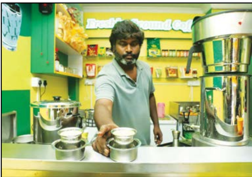
Coffee at Mirras

twenty rupees. The Mirras shop is at No.26, East Mada Street, Mylapore.