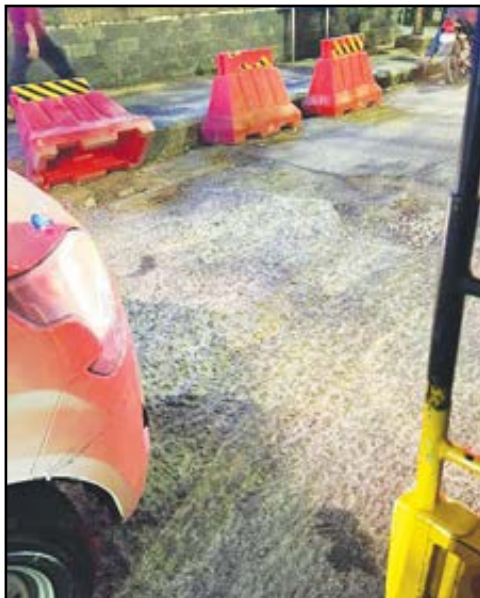
'Danger' on road near Billroth Hospitals

This column also contains comments posted on our social media pages.