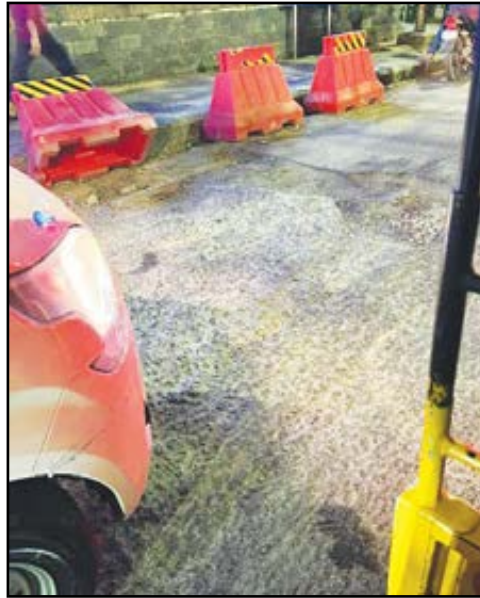
'Danger' on road near Billroth Hospitals

This column also contains comments posted on our social media pages.