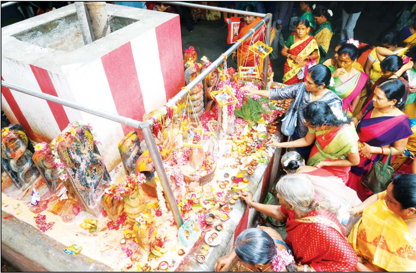
Devotees streamed into Sri Mundagakanni Amman Temple, Mylapore on Friday, July 18 morning which marked the first Friday of the aadi season. They performed rituals and offered prayers.