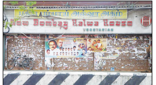
What remains of New Bombay Halwa House