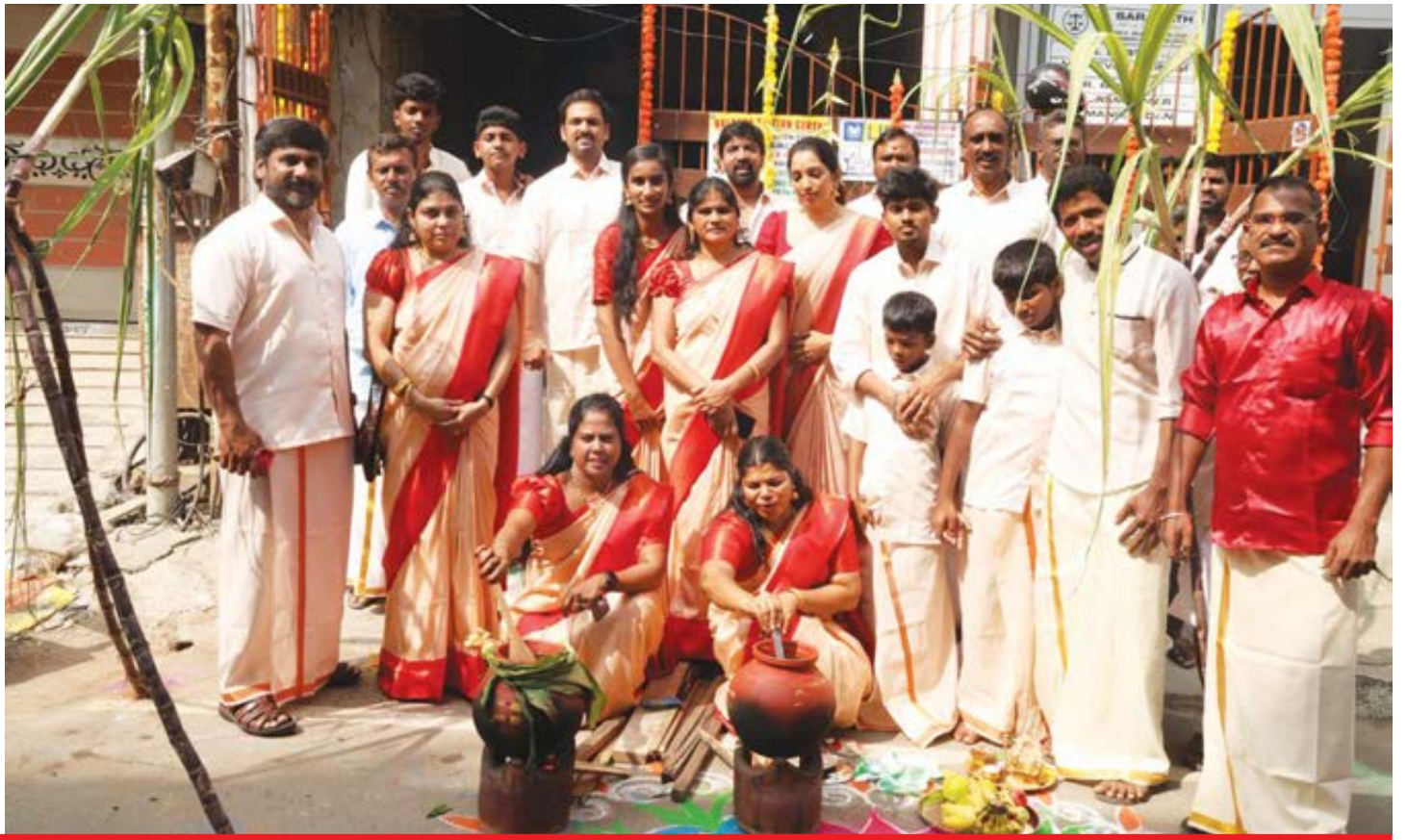
This group of families in Apparswamy Koil Street, Mylapore celebrated the Pongal festival in a traditional manner in a semi-public space in this colony.