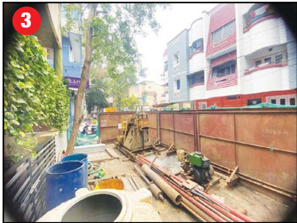
Soil tests are now on in areas on the east side of the road. This indicates Metro's engineers are keen to study another zone after the tests carried out along R. K. Mutt Road. Test centres will pop up in many streets here.