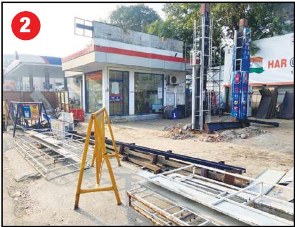
Soil tests conducted earlier along sections of this south side of this busy road seem to be over now. But will the rail line run almost under the R. K. Mutt Road section or take a slightly different route?