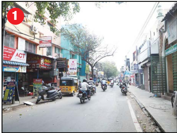
The Metro's underground rail line to be constructed in the section between Mandaveli Street ( Post Of- fice junction) and MTC bus terminus zone will see work in a densely populated area. People living here will need to watch the status of their houses ( for cracks, etc) when work is in full swing.