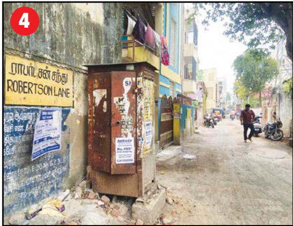
Residents in Raja Street and elsewhere want Metro to be transparent in sharing information in case the project could affect houses / apartments. Two meetings scheduled by Metro have been postponed recently.