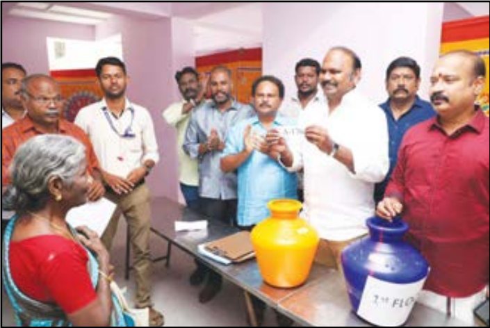
Mylapore MLA takes part in draw for flats allotment

delay are cheesed off by the promises the DMK party has made periodically. “The corona pandemic caused a delay alright but we should have got the flats last year. Who will pay us for the rents that we shell out?”, complained a person whose family’s documents have been okayed to occupy a third floor flat here. Some 570 families moved out of this campus in December 2019 and 630 flats have been built in three blocks here. Allotment was made recently to all those entitled to residence here. But all of them have had to submit documents that meet the rules and only they are given the keys to the flat.