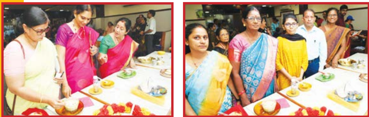
Photos are of some entries on display, judges at work and some of the winners