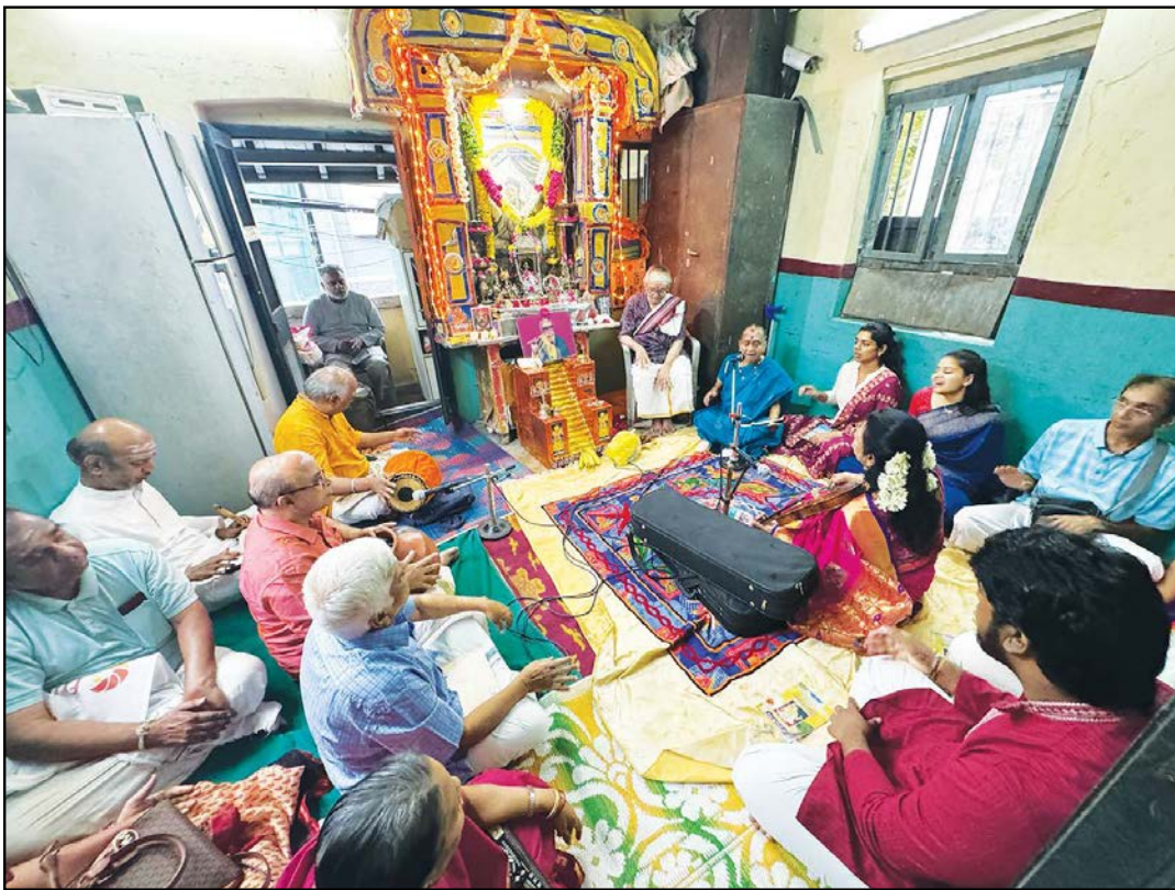
Senior artistes, music students and rasikas gathered at this old Mylapore house located on Mathala Narayanan Street, Mylapore to mark the annual Thyagaraja aradhana event. The aradhana, which celebrates the music of saint-composer Thyagaraja, has been held in this house for over 80 years