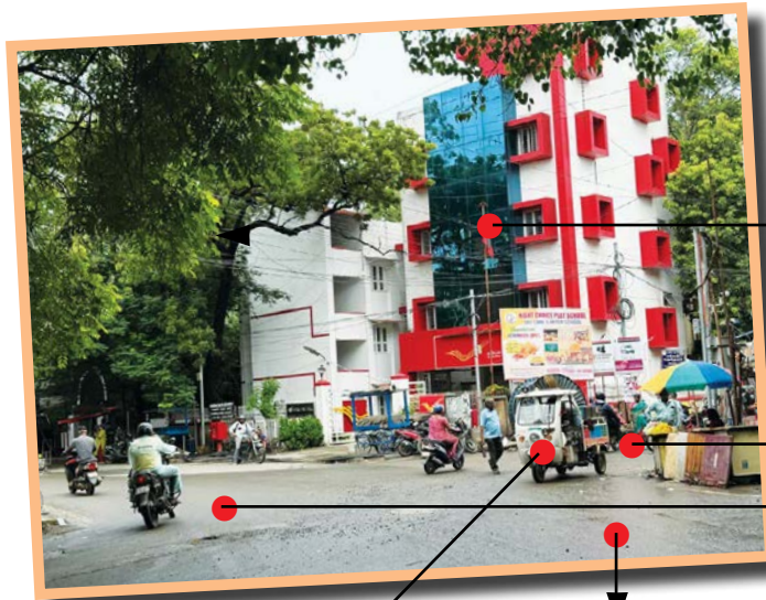
New Mandaveli Post Office