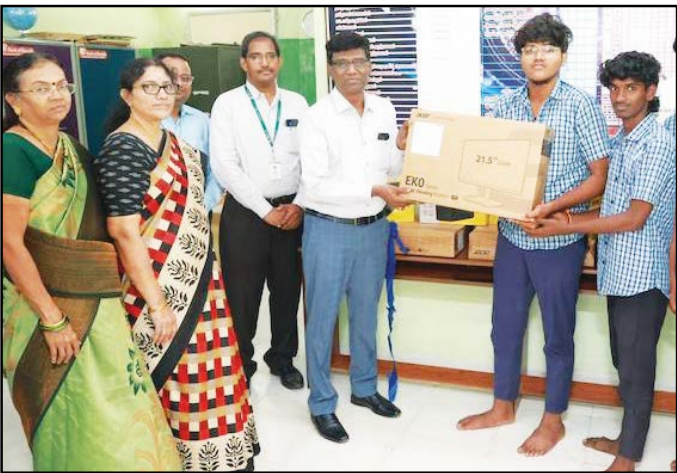
By Our Edit Team

The IDBI Bank's Alwarpet branch donated computers and xerox machines to Chennai Higher Secondary School located in Bheemana Street in Alwarpet