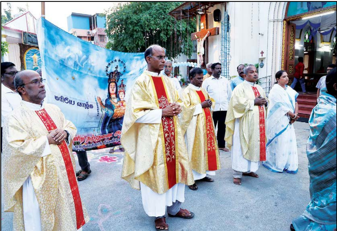
Flag hoisting at Our Lady of Guidance Church (above): the illuminated church in Luz (below)