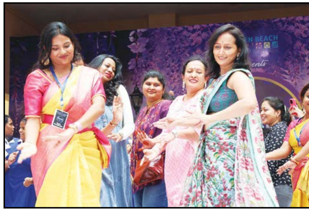
Reunion at Rosary School: The 'Wow' work

This column also contains comments posted on our social media pages.