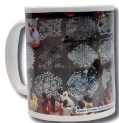
● COFFEE MUGS Rs. 250