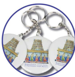
● KEY CHAINS Rs. 30