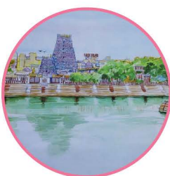
● INK ILLUSTRATIONS Rs. 100/200