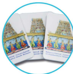
● FRIDGE MAGNETS Rs. 100