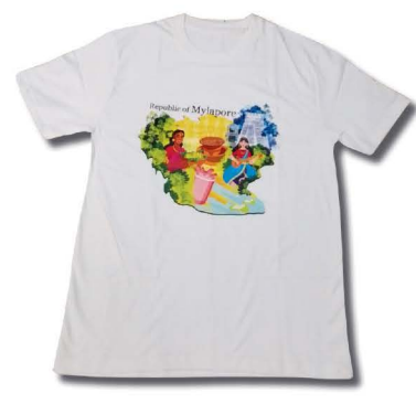
● T-SHIRTS Rs. 300

Call Mylapore Times - 2498 2244 to buy / order