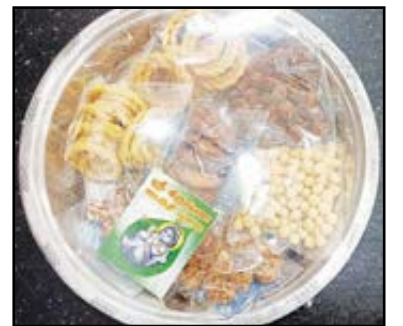
The goodies from Deepam

To cater to the needs of people who celebrate Sri Krishna Jayanthi and prefer to have a full set of prasadam for neivediyam, Deepam Sweet and Karam shop in R A Puram is offering customized jute bags with 11 items including uppu seedai, vella seedai, kai murukku, kadala urundai, aval, manoharam and adhirasam.