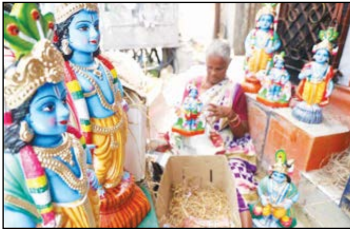
Images of lord Krishna are now on sale by hawkers on North Mada Street, Mylapore. Prices range from Rs.100 to Rs.2,000