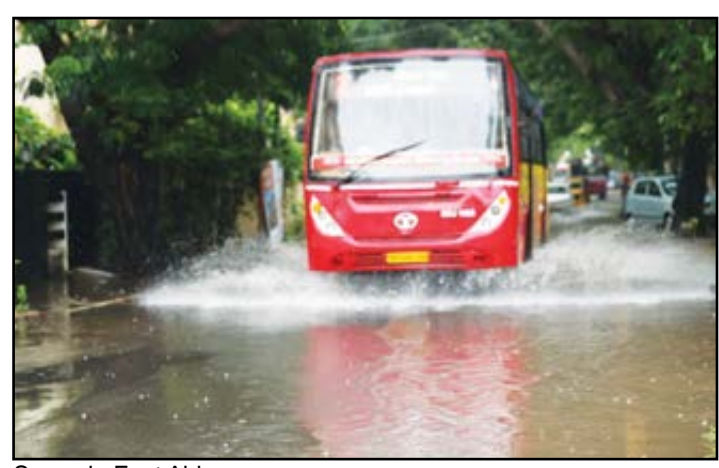
Scene in East Abiramapuram

Imagine water stagnating across a key road like P. S. Sivaswamy Salai and then, sewage gushing out of it and polluting the area.