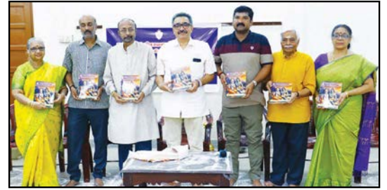
Guests at THAMBRAS' panchangam release event