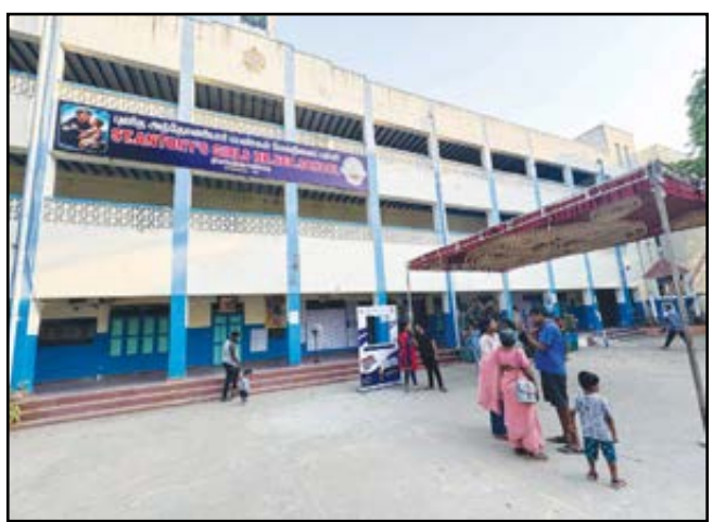
Scene at St Anthonys Girls School, R A Puram at 4.30 p.m.

■ Basic arrangements at booths were good. But in some places, there were either weak ELECTIONS ramps or no ramps at all. In some schools, where multi rooms were employed as poll booths, the spaces were dinghy, stuffy and small - just not suited for a public process. More so, not in searing summertime.