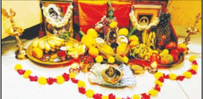
By Ganga Sridhar