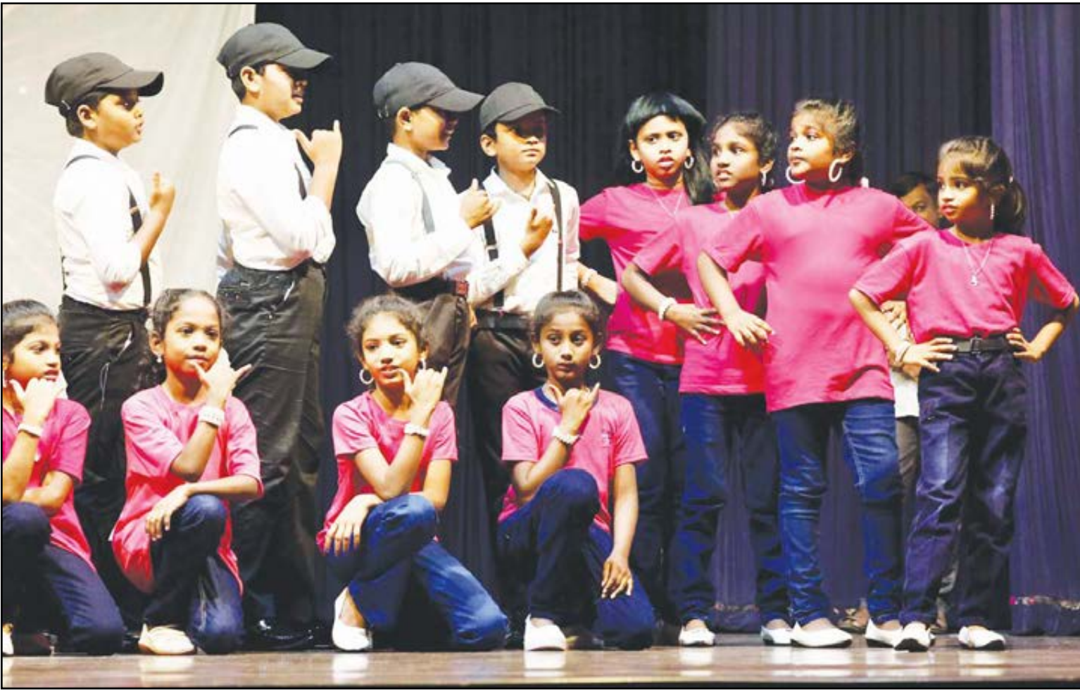
Chellammal Vidyalaya Nursery and Primary School celebrated its annual day with an event at Bharatiya Vidya Bhavan's on April 6. Students of this Mylapore school presented a medley of music and dance recitals.

NOTE TO READERS / ADVERTISERS MYLAPORE TIMES' next issue will be circulated on Sunday, April 21. Adverts booking open till April 20 noon.