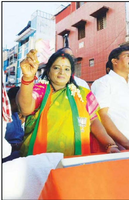
BJP's Tamilisai Soundararajan in Mada Street