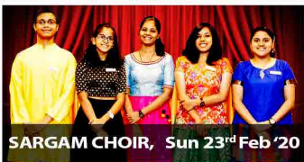
SARGAM CHOIR, Sun 23 rd Feb '20

Catch us LIVE - 8.00 - 8.30 am on Music of Madras Facebook Page